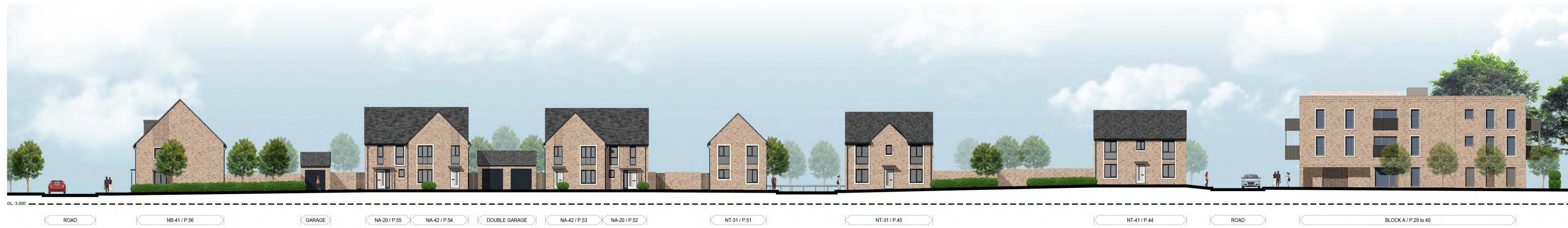
06 STREET SCENE WITHIN DEVELOPMENT 1:250