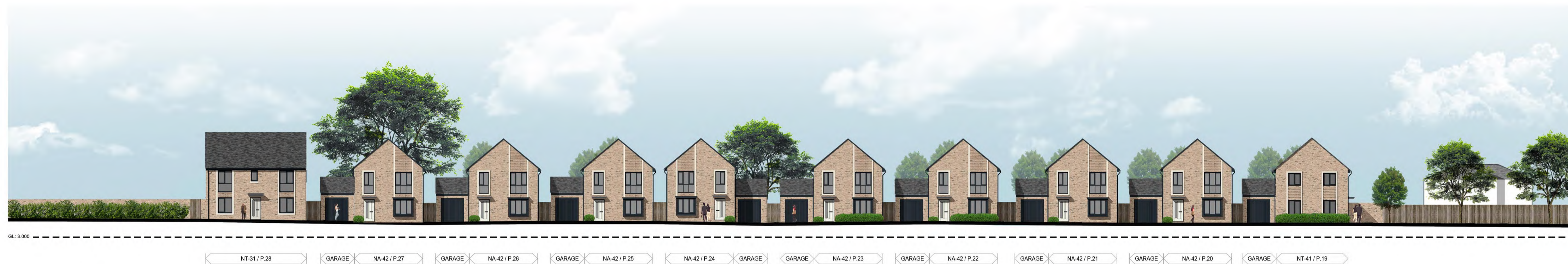
05 STREET SCENE TOWARDS HORSESHOE CRESCENT DEVELOPMENT 1:250