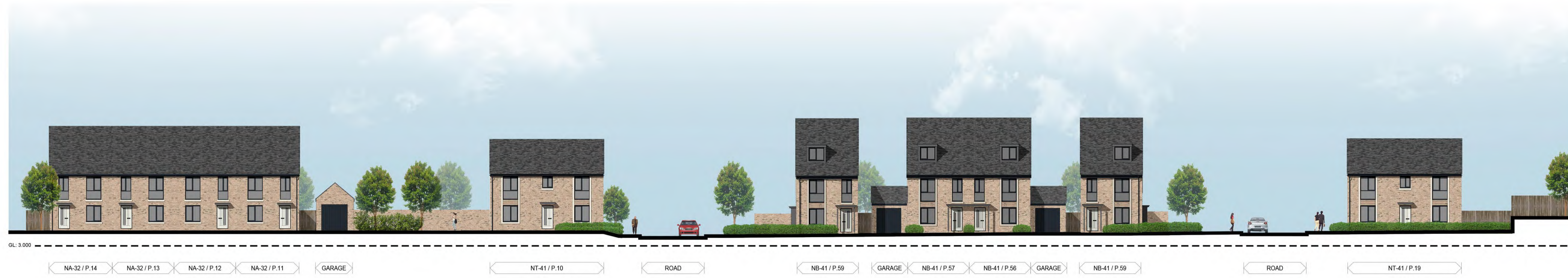
04 STREET SCENE FROM CHAPEL ROAD / NEW GARRISON ROAD 1:250